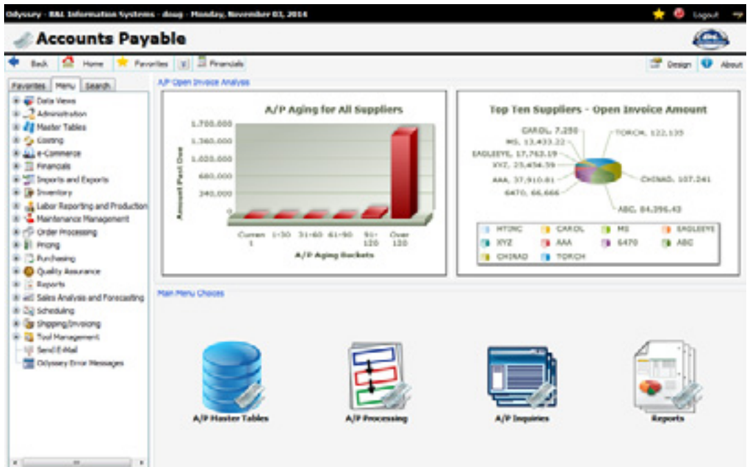
(Sample Visual of Accounts Payable Dashboard)

B&L will keep you posted on the status of the Web UI and, more importantly, what it means to you. Training documents and videos will be forthcoming, including a summary of the differences between the existing Windows UI and the new Web UI.